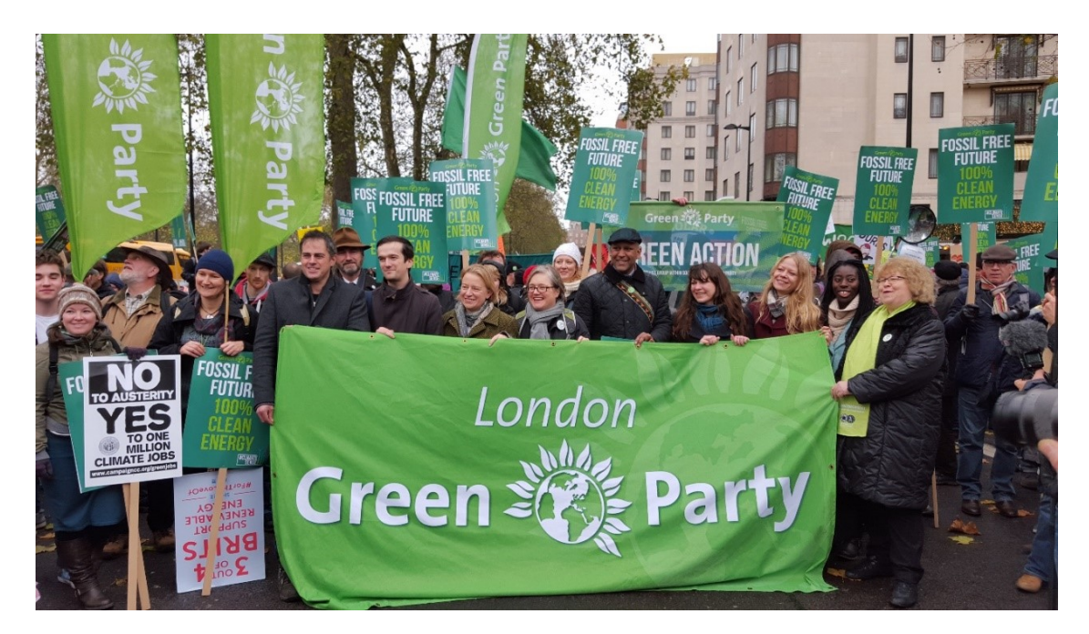
ABOVE: Green Party Leaders, MEP's, London Mayoral Candidate and Spokespeople at the Climate, Justice and Jobs march in London on 29th November 2015. BELOW: The 'Green Bloc' marching